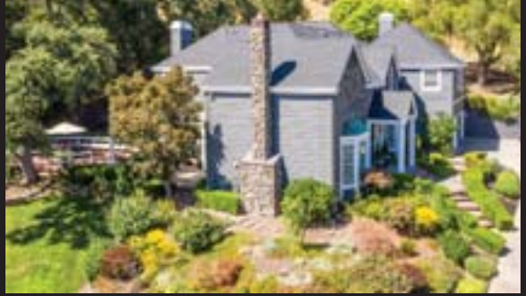
4450 Walnut Boulevard, Walnut Creek 5 Bed | 4 Bath | $2,150,000 4450WalnutBlvd.com